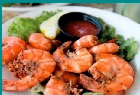
KEY WEST PINK U-PEEL SHRIMP

Broiled to perfection and ready for you to peel & eat. Served hot or cold with our Cocktail sauce.